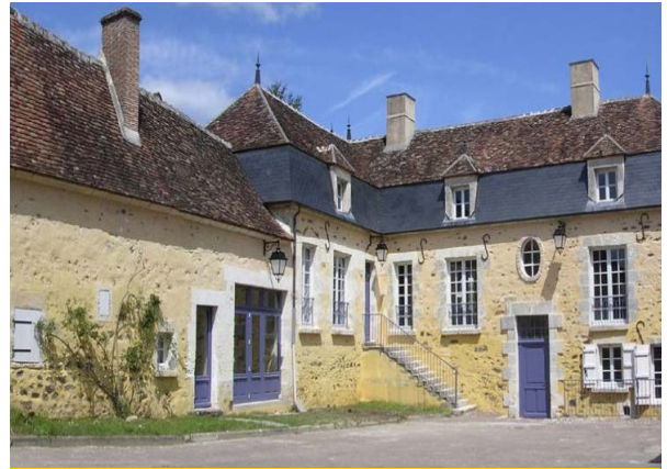
Le couvent de treigny