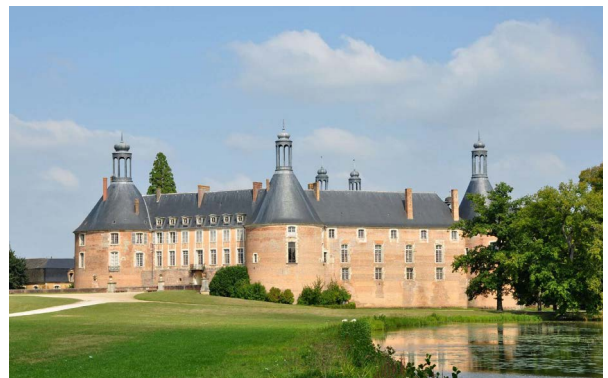
Château de Saint Fargeau - Saint Fargeau