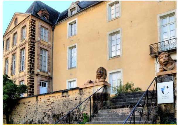
Musée Colette - Saint-Sauveur-en-Puisaye