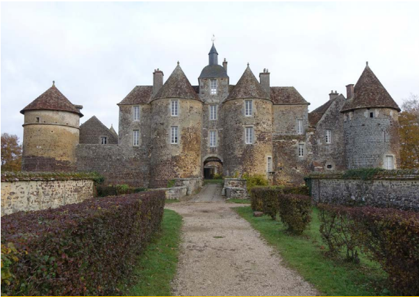
Château de Ratilly - Treigny