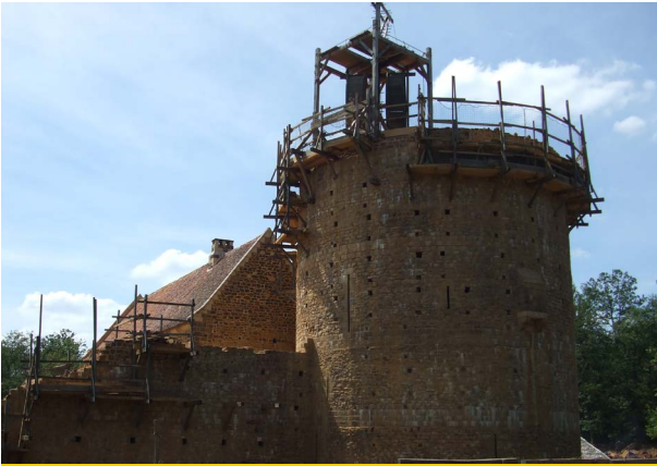
Château de Guédelon - Treigny