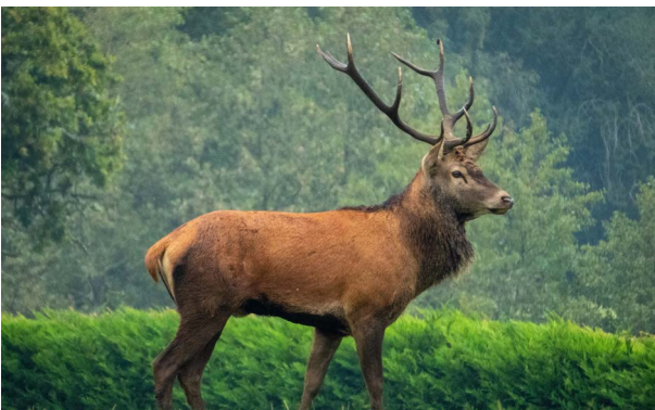
Parc Animalier de Boutissaint - Treigny